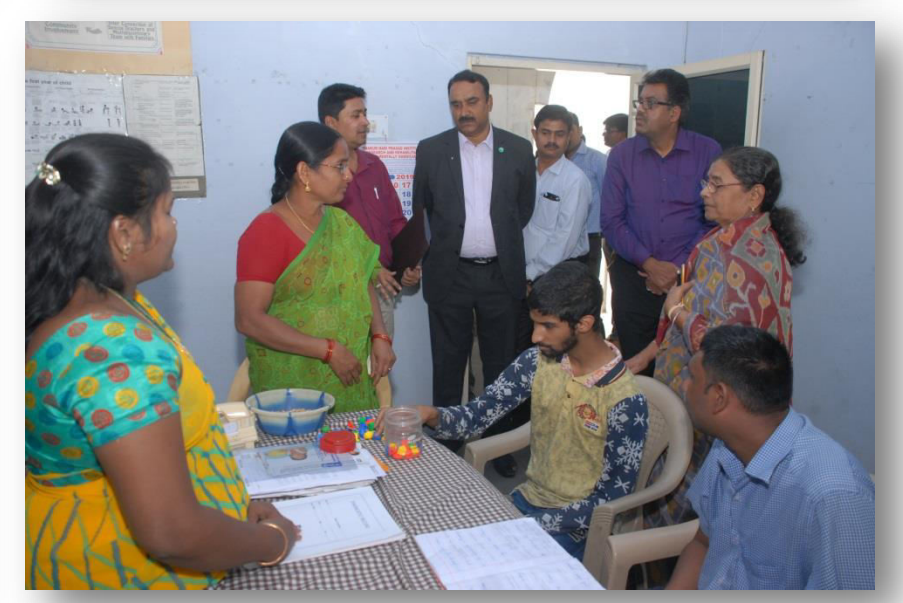
COPYRIGHT © 2013 MITSUBISHI ELECTRIC CORPORATION. ALL RIGHTS RESERVED.